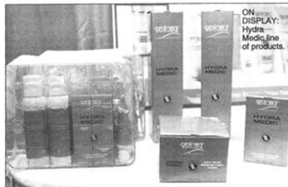
ON DISPLAY: Hydra Medic line of products.

Speaking to the Express , actress/comedienne Cecilia Salazar, one of the participants on whom the products were used, said, "I have never used Repechage before and I have only had one facial