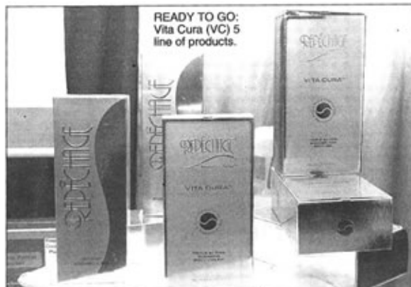
READY TO GO: Vita Cura (VC) 5 line of products.

The Hydra Medic line of products is for people with problem/acne skin. It is specifically designed to leave skin healthier, smoother and ultimate-